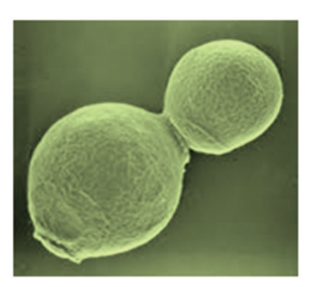
Figure 1 Budding Yeast

cells in a sterile and controlled manner. Despite the vigorous nature of bead mill homogenization, downstream molecular analyses methods are unaffected and samples are open to a variety of methods including PAGE, Western blotting, protein functional studies, and nucleic acid purification. Herein we describe the methods used by Szymanski and Kerscher to disrupt yeast cells for western blotting and protein functional studies.