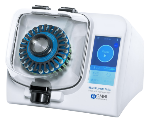
Bead Ruptor Elite