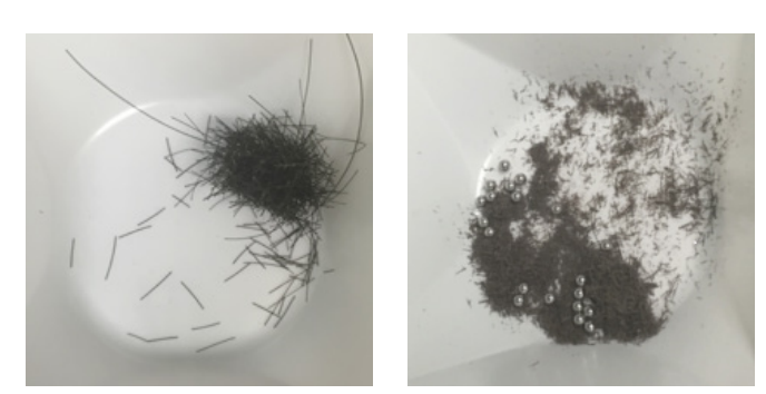
Figure 1: 20 mg of equine hair pre and post processing on the Bead Ruptor 24. Post processing hair was converted to a fine powder that was easily dissolved in extraction buffer.