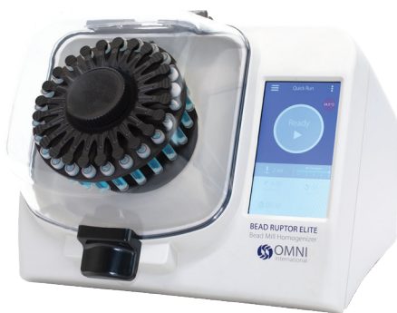
Bead Ruptor Elite™ Bead Mill Homogenizer