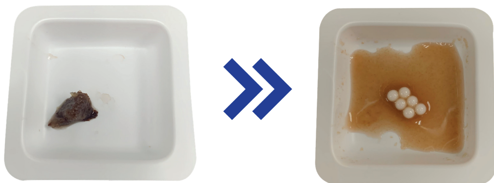
Figure 1: Pre and post-processing images of 200 mg placenta tissue.

A complete homogenate was obtained after 1 minute of processing time (Figure 1). Downstream BCA Total Protein quantification yielded an average protein concentration of 1064 \mu g/mL (Table 3). Protein concentration was determined based on the equation generated from the standard curve, using BSA standards for measurement of absorbance at 562 nm.