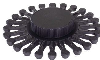
Bead Ruptor Elite™ Bead Mill Homogenizer Finger Plate