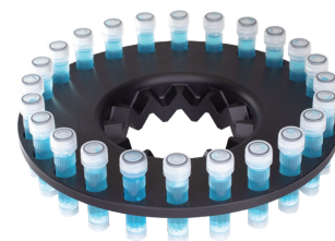
2 mL Tube Carriage Kit