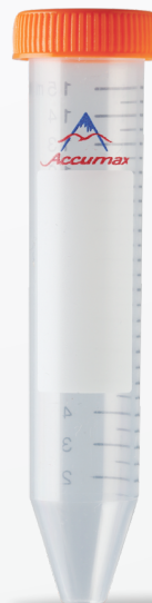
15 ML 17000 g