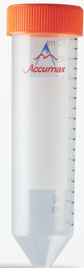
50 ML 20000 g