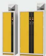
Fire Safety Cabinet

Don't forget we also sell LAB COMPANION – our one-stop shop for all your laboratory needs!