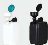
Safety Waste Disposal System