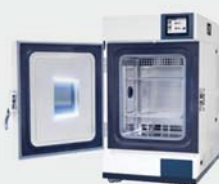
Temperature & Humidity Chamber