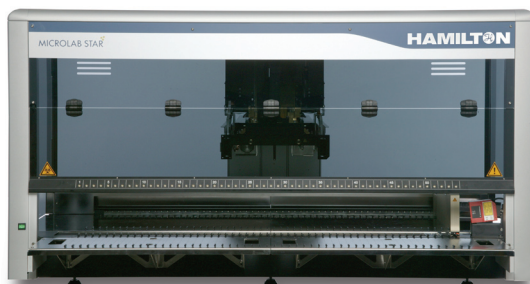
Figure 1: A MICROLAB® STAR, equipped with 8 individual 1000µl channels was used in this study.