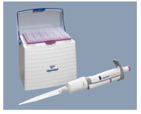
Precise one-step pipetting with Eppendorf pipettes and epT.I.P.S.<sup>®</sup> 5.0 mL