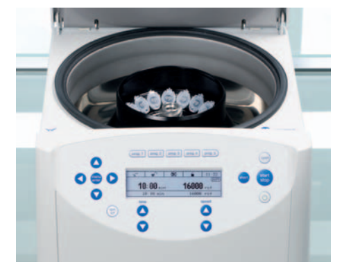
Safe centrifugation with Eppendorf Centrifuges