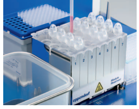
Easy integration in the ep Motion automated pipetting system