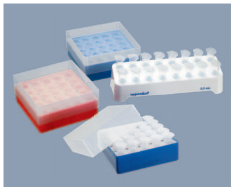
The ideal solution for sample preparation and storage: new racks and storage boxes