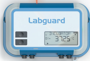
Radio OR Ethernet transmitters