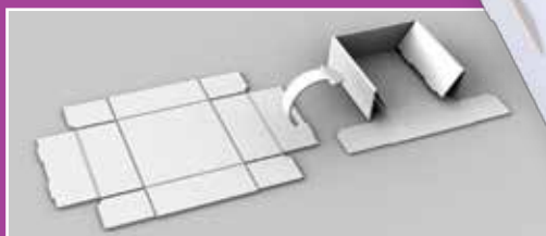
Trays are supplied "flat-packed" Reducing the amount of space needed for storage