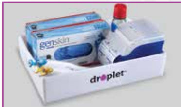
Use for storage or transport of laboratory products